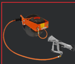
GAS HOSE REEL